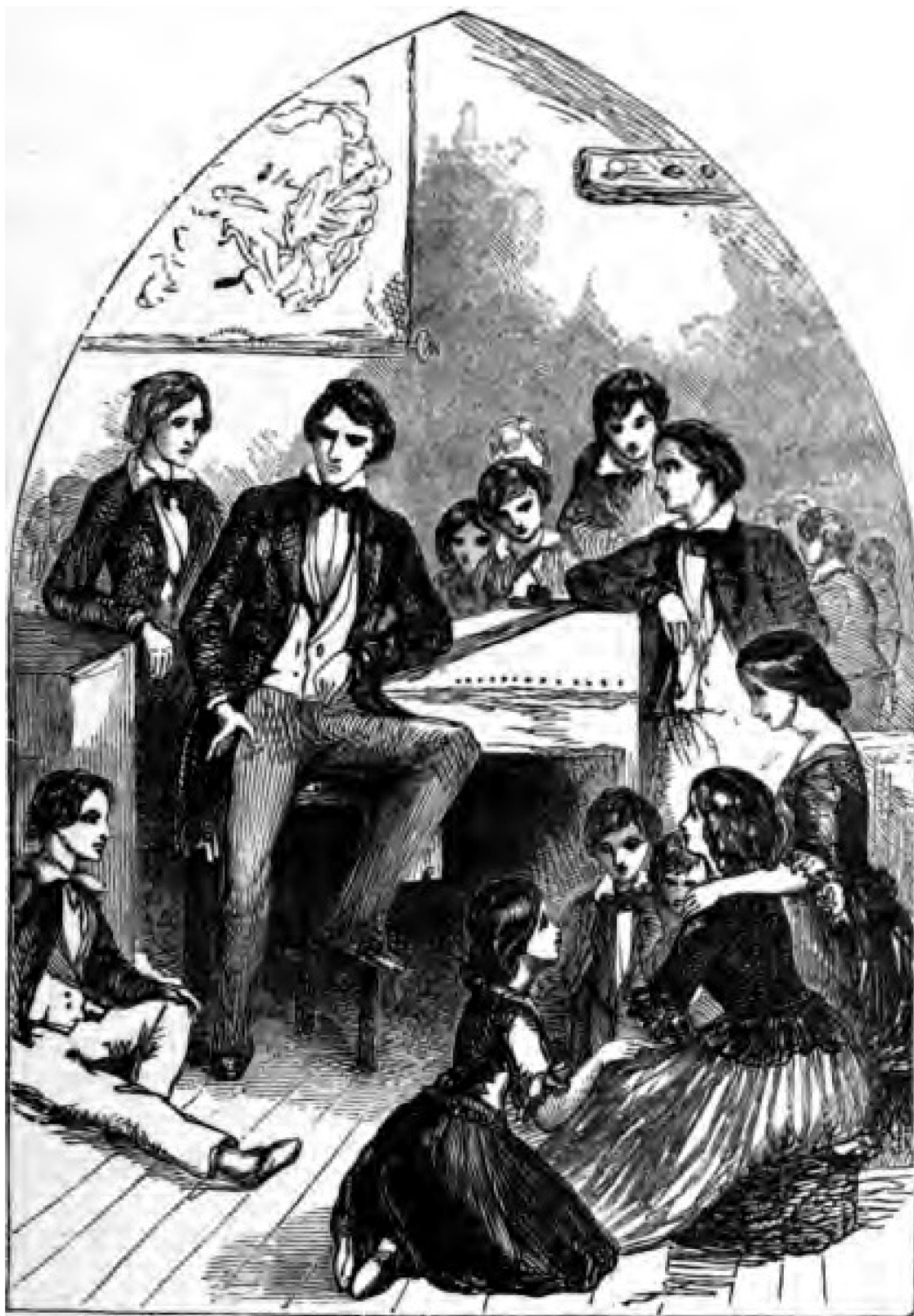
THE TEACHER'S STORY.